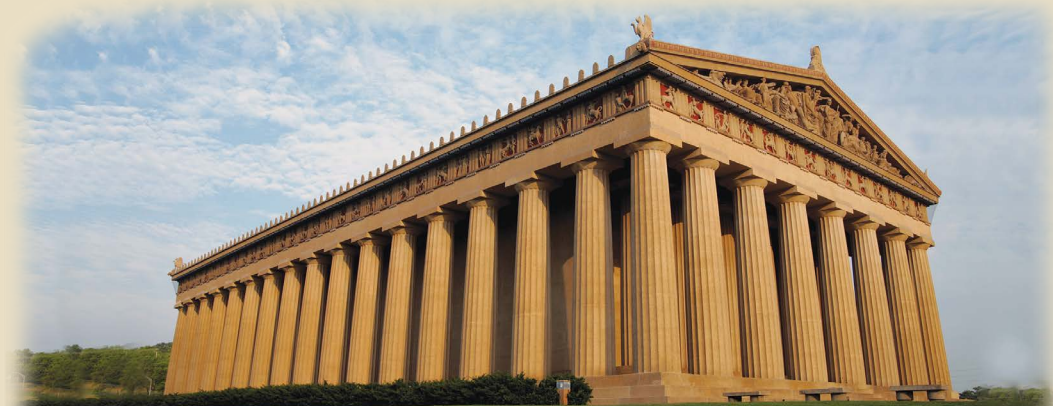
The Parthenon, Centennial Park, Nashville.