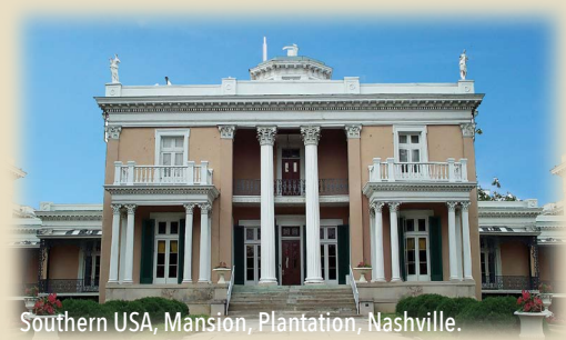
Southern USA, Mansion, Plantation, Nashville.

one said, 'I knew that this was coming. I knew that God's judgments were soon to fall.' 'You knew that these things were coming?' said another. 'Why did you not tell us? Why did you not warn us, and show us the prophecies, that we might also know? '" (Manuscript 158, 1904, emphasis added)